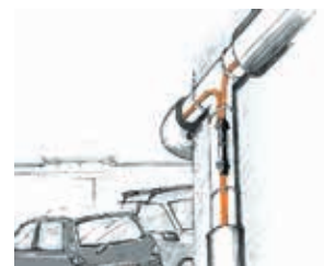
Frost protection of oil pipes