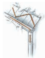
Heating of gutters and roofs