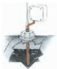
Frost protection of oil pipes