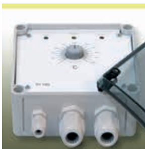
Electronic temperature regulator HM-EC200

For temperature regulation we suggest our program of electronic control and temperature regulation appliances and corresponding temperature sensors.