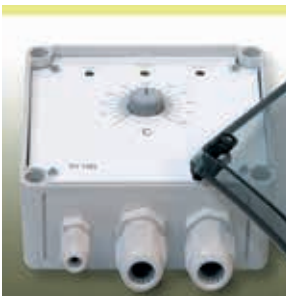
Electronic temperature regulator HM-EC200

For temperature regulation we suggest our program of electronic control and temperature regulation appliances and corresponding temperature sensors.