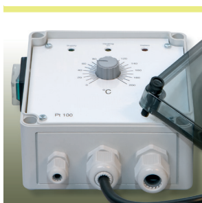
Electronic temperature regulator KM-EC210

For temperature regulation we suggest our program of electronic control and temperature regulation appliances and corresponding temperature sensors.