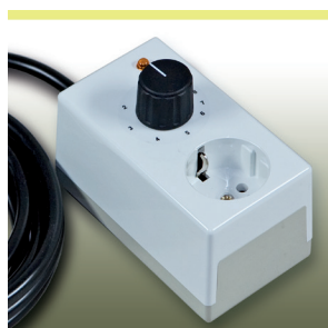
Power controller KM-L116