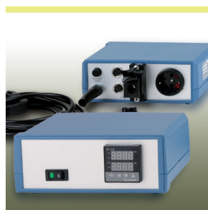
Electronic laboratory regulator series KM-RX1000