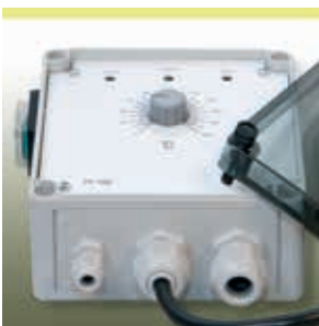
Temperature regulator HM-EC 210