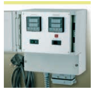
Regulator- and limiter- combination HM-RD 3000