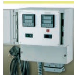
Regulator- and limiter- combination HM-RD 3000