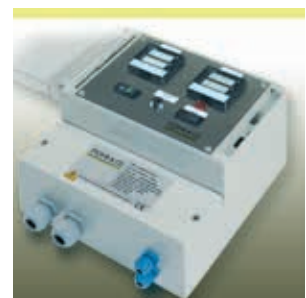
EExi-regulator combination HM-RD 4011