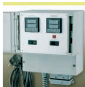
Regulator- and limiter combination HM-RD 3000