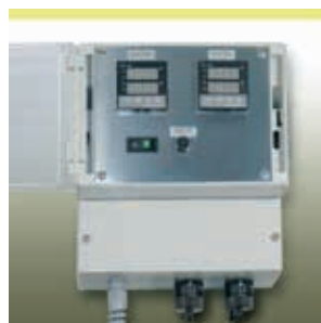
Double-regulator HM-RD 2000