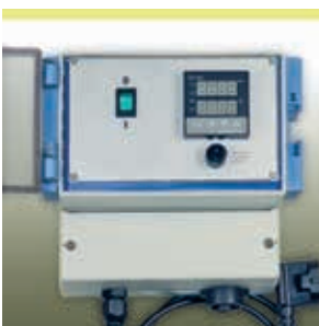
One hand regulator HM-RD 1000

We supply a full range of controllers and temperature regulators: