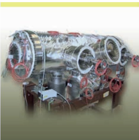
heated vacuum recipient