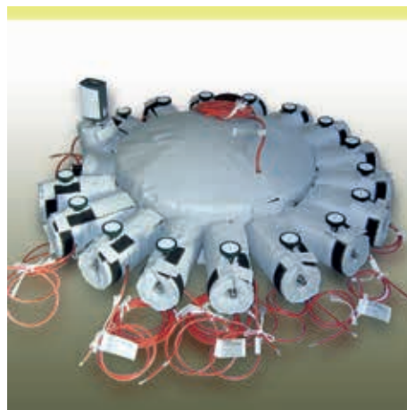
heating calibration system